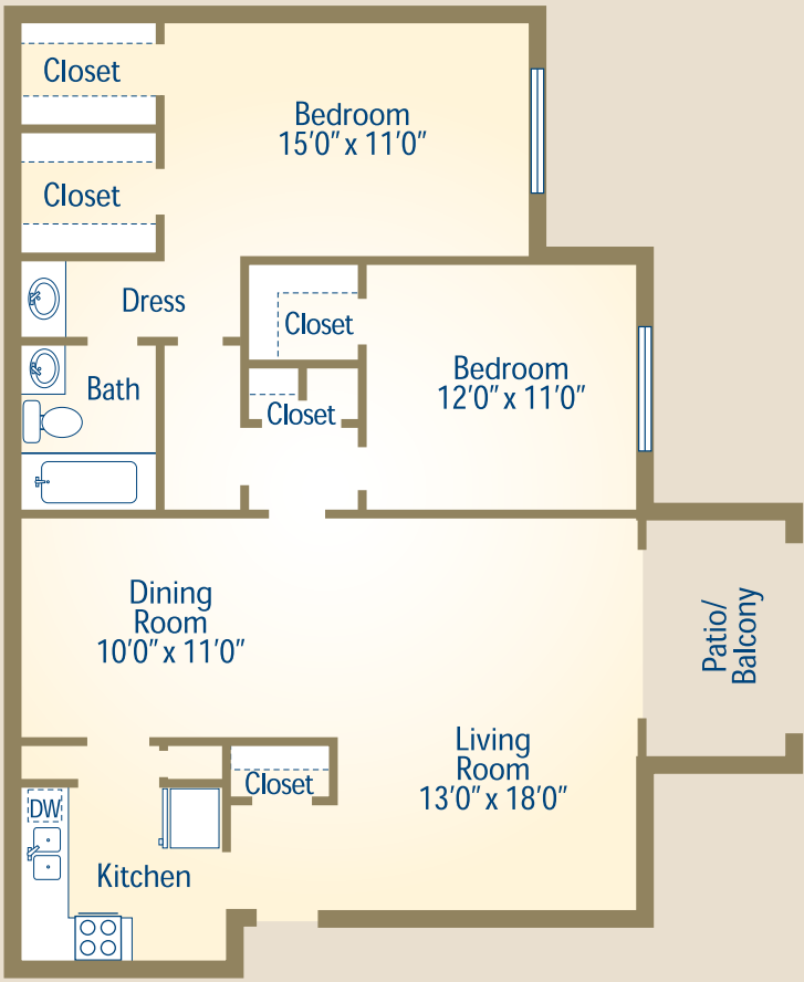
2 Bed 1 Bath • 930 Sq Ft • The Blakely